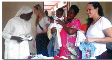
Blessing of St. Mary's Maternity Ward

We blessed Our Lady of Fatima Church and also St. Ann's Church. Now there are 26 blessed—with four more to go—over the next two years. We blessed St. Mary's newly renovated maternity ward. This was truly a big, big occasion because the nearest hospital is 26 miles away for babies to be born in. Now 15 to 20 moms can have babies born locally in relative safety. We also blessed Trinity Catholic High School's new administration wing. It is very attractive. And we blessed the new boys' dorm where 150 high school boys sleep.