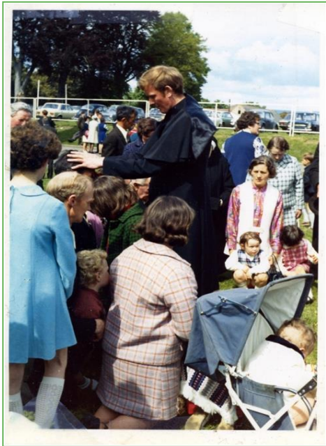
Ordination Day June 11, 1072