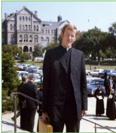
Washington D.C. 1973 Summer Conference