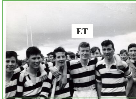
Ireland Hurling Champs, Senior Year High School, 1965