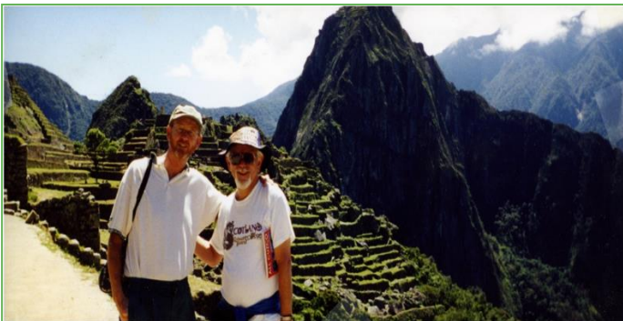
Machu Pichu, Peru