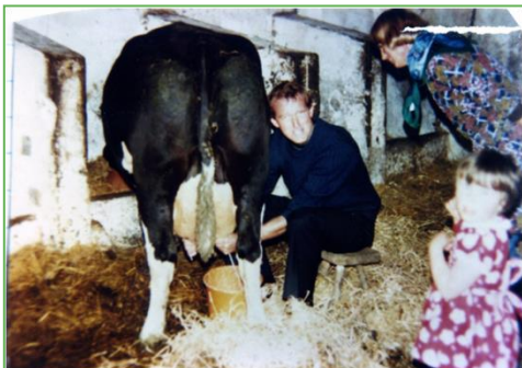
Giving a "Yank" milking lesson which I started doing at 6 or 7 years of age