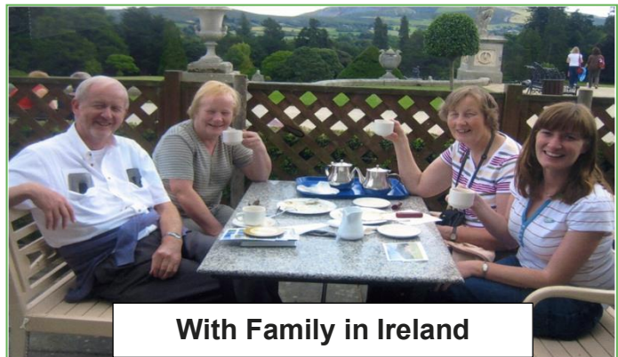
With Family in Ireland